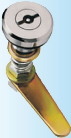
3D Rendered View